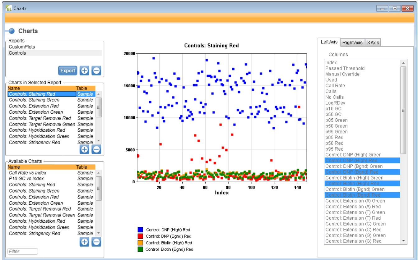
Figure 3: Quality Control Visualization —Beeline Software generates various charts for visualization of QC performance. Charts can be saved in PDF format for viewing outside of the software.